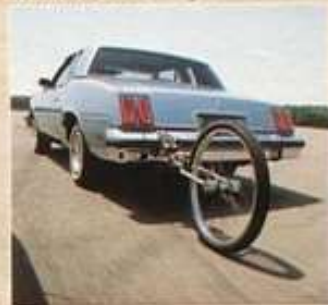
Olds engineers check out fuel economy in a new-generation Cutlass Calais.

Today, the kind of fuel economy you expect from a car is a most important part of your buying decision. That's why Oldsmobile