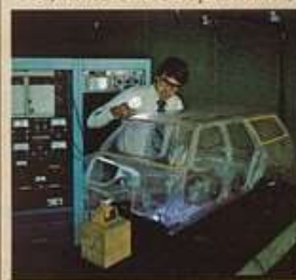
Many Cutlass components were "road tested" by computer simulation before a single car was built.

finite analysis computer technology, many Cutlass components were "road tested" by computer simulation and fine tuned at the design stage.