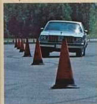
Test models log thousands of miles during ride, handling, braking and acceleration evaluation.

Oldsmobile believes that you expect your car to be more than roomy and comfortable—it must