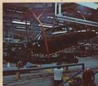
New Lansing, Michigan, Cutlass plant offers the latest assembly technology and quality control methods.

So you can see why new-car prospects have come to expect excellence in engineering in an Oldsmobile—and why Olds-