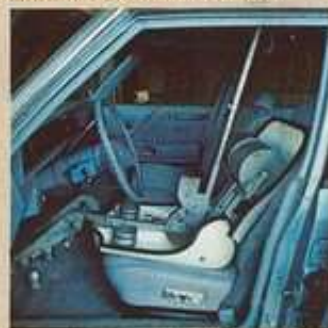
A new-generation Cutlass, designed from the inside out for space efficiency, comfort.

In the last two years, the introduction of a new generation of space- and fuel-efficient* full-size and mid-size models. Plus the